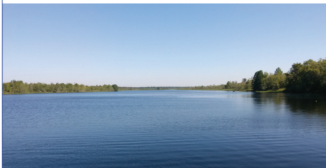
The Bushy Park Reservoir, Charleston Water System's primary water source.